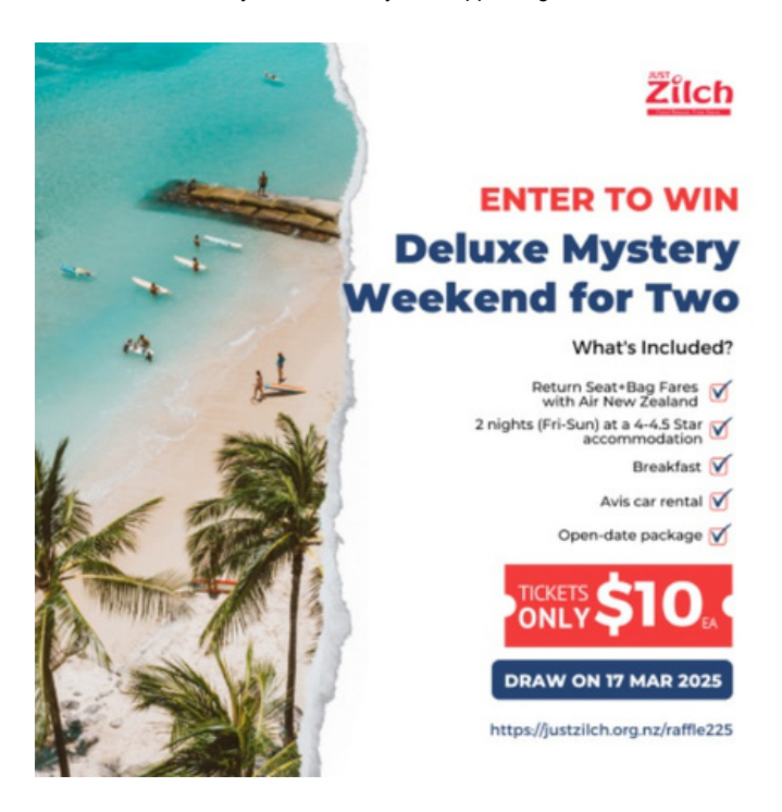
Get Tickets Here

The lucky winner will be drawn on Monday 17 March—we'll even live stream it on Facebook! Grab your ticket today and support a great cause!