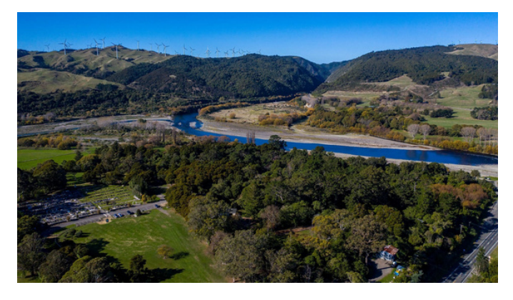
Submission are open NOW until 4th March 5pm Your voice counts. Please submit to help make natural burials an option for our community.

You will find the online submission at the link below.