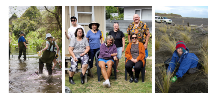
In this issue: We're welcoming a new group to our network, celebrating volunteers, and have some interesting updates from Foxton. Plus, we're taking action on environmental issues with protest efforts against coal mining, stream clean-ups, a job opening and upcoming events you won't want to miss!